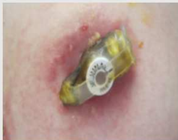
Figure 2. After one month of using superabsorbent drainage dressings.