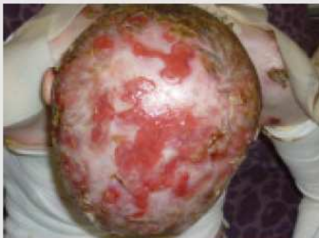
Figure 2. After four weeks of treatment with Flaminal® Hydro.