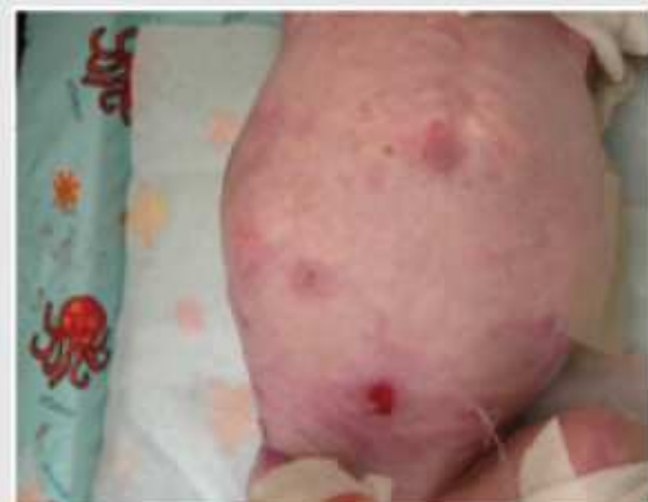
Figure 3. Aged 13 months following treatment with a lipido-colloid as a wound contact layer with a hydrogel impregnated gauze as a secondary dressing.