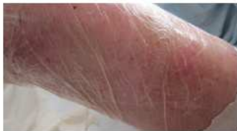
Figure 10 (right). Cling film is applied directly to intact skin and open wounds.