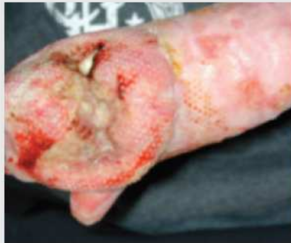
Figure 1. Fungating wound on the dorsum of the left hand three weeks after initial breaching of the skin.

Additionally patient choice plays a part, and the EB patient is frequently the final arbiter in choosing which dressings he or she will or will not use.