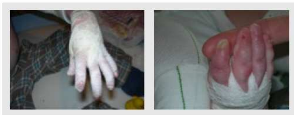
Figure 4 (right). Modified hand wrapping to allow greater freedom of fingers (to be used in infants and toddlers for messy play and finger feeding). May be preferred by older children and adults.

Hand wrapping using a soft conforming 2.5cm bandage that provides downward pull on the web spaces and around the palm, is useful in preventing the loss of web spaces by forcing down the skin (Figures 3 and 4). In some children extending this technique to wrapping each finger individually has been successful in maintaining good results after surgery. Any open wounds or blister sites should be covered with a non-adherent dressing before wrapping and intact skin should be protected with a layer of greasy emollient.