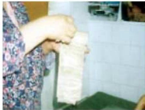
Figures 7-9 (above). Melted fat is spread onto toilet paper; the toilet paper is wrapped around skin and wounds; it is easily removed without adherence.