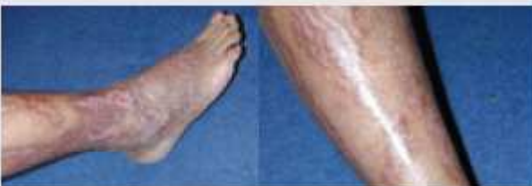
Figure 2. Patient 2 two months after commencement of treatment using sheet hydrogel dressings.