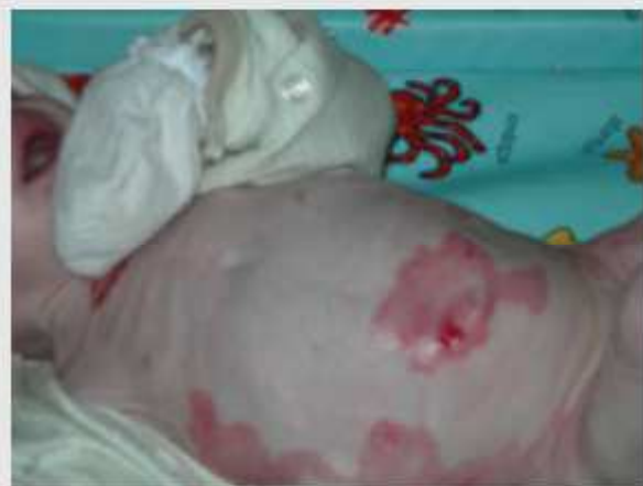
Figure 2. Patient aged six weeks after switching to a hydrogel impregnated gauze.