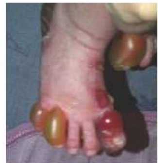
Figure 1. Blisters on toes in patient with EBS.

Some patients advocate using sterilised scissors or a scalpel blade to create a larger hole to prevent the blister from refilling. The roof should be left on the blister unless personal preference is to de-roof it to prevent refilling, but de-roofing can lead to additional pain and should be discouraged if possible.