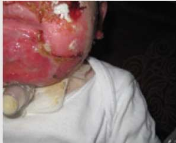
Figure 1. Aged one year. Flaminal® Forte was applied for four weeks only then Dermovate™ NN on a daily basis.

The overgranulation tissue gradually reduced and healing took place. Flaminal was applied for four weeks only then Dermovate™ NN on a daily basis. The quality of the healed skin was good and it resisted blistering. By two years of age the patient's lower face had healed ( Figure 2 ) although the top of his nose and forehead remained fragile with a tendency for the skin to break down when he rubbed these areas.