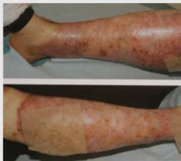
Figure 2. Eighteen months after change of dressing regimen and reduction in activity levels.