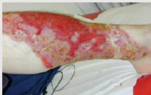
Figure 1. The patient's wound upon presentation.

The wound was washed with Octensian® (Schülke) at each dressing change to prevent infection and Dermovate™ NN (GSK) was applied to overgranulated areas for three days after which there was a reduction in hypergranulation tissue. 50/50 emollient was used to soften the hyperkeratotic areas and aid manual debridement with forceps. Urgotul® was used as a primary dressing to ascertain whether the patient was intolerant to the impurities in the soft silicone dressings he had been using. Urgotul® (Urgo) has atraumatic application and removal and can also assist in reducing overgranulation. Mepilex® Transfer (Mölnlycke Health Care) was used to ensure that exudate transferred away from the wound bed and the periwound skin to the secondary absorbent dressing. Release® (J&J) dressing was used as this was the patient's preference. The patient also made the decision to resign from his employment to focus on trying to heal this wound by ensuring rest and regular dressing changes. K-Band® and Tubifast® were used for retention. Cavilon™ (3M) was used to protect the periwound from maceration.