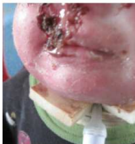
Figure 6. When using a tracheostomy tube in small infants an extension tube may be needed to prevent it rubbing under the chin.

The proximity of the tube in relation to the underside of the chin in small infants can lead to wounds on this area and an extension to the tube should be considered to avoid this (Figure 6).