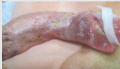
Figure 2. Strips of Hydrofiber® are placed between the toes (all toes except the great toe fused in this infant).