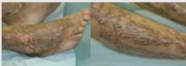
Figure 1. Patient 2 before the application of hydrogel sheet dressings.