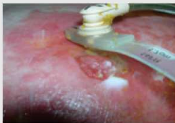
Figure 1. Gastrostomy wound before being treated with superabsorbent drainage dressings.

Leakage continued but was contained with the super-absorbent dressings. Clothing remained dry which was important to the patient. Over the course of six weeks the wound decreased in size to a 1cm x 1.5cm area beneath the gastrostomy button and the large area of excoriation healed (Figure 2). Pain scoring on the Wong Baker Scale dropped from 10 to two during both dressing changes and wear time.